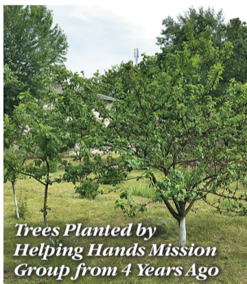
Trees Planted by Helping Hands Mission Group from 4 Years Ago