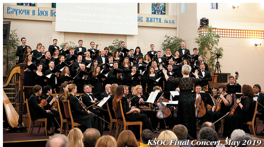
KSOC Final Concert, May 2019