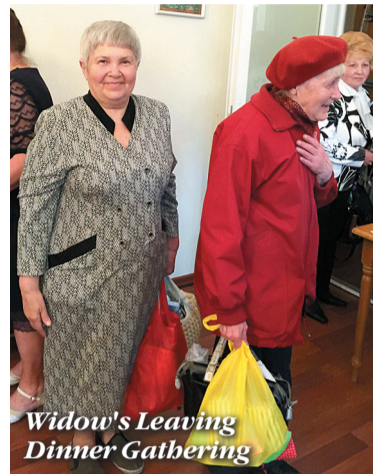
Widow's Leaving Dinner Gathering