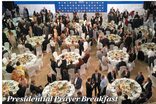
Presidential Prayer Breakfast