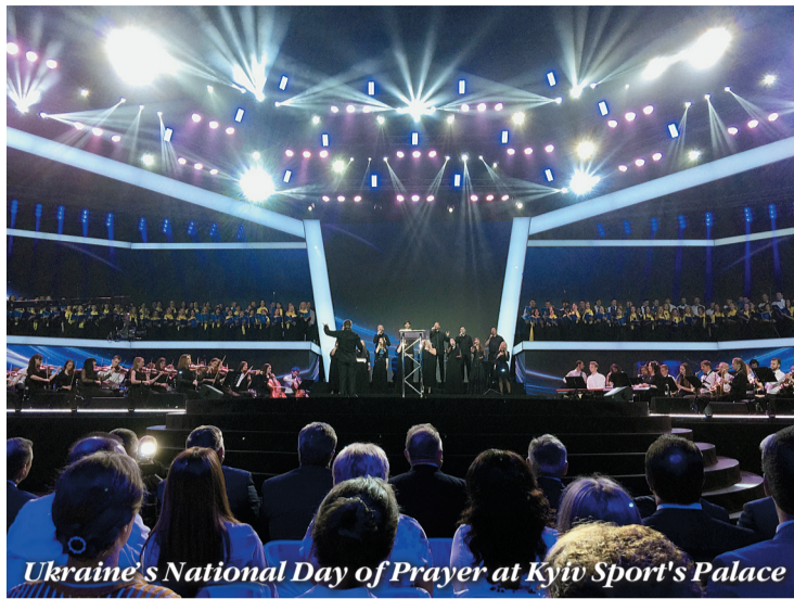
Ukraine's National Day of Prayer at Kyiv Sport's Palace

One major theme heard several times was 2 Chronicles 7:14 which says, "If my people, who belong to me, humble themselves, pray, seek to please me, and repudiate their sinful practices, then I will respond from