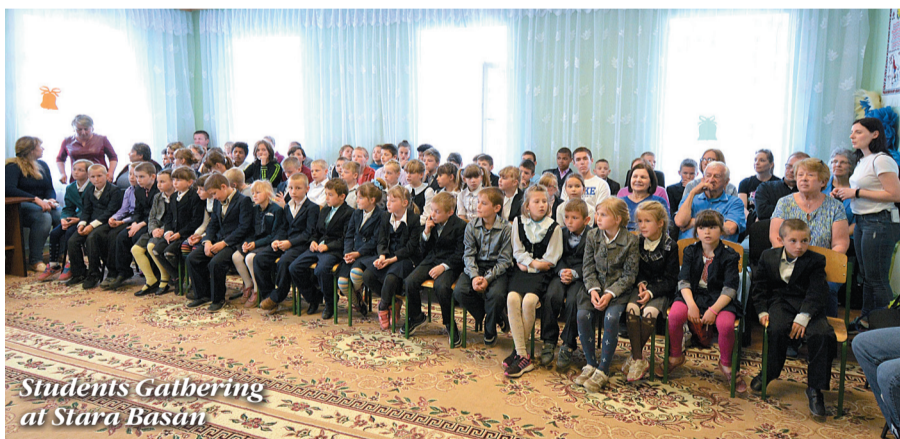
Students Gathering at Stara Basan