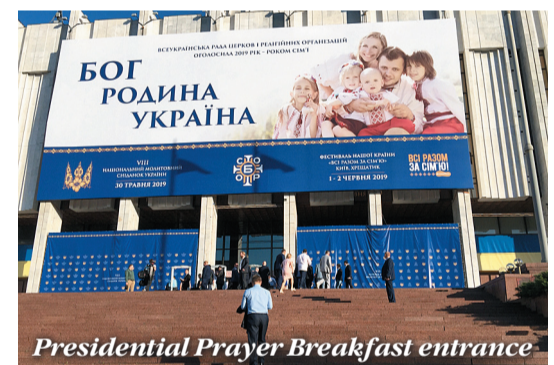
Presidential Prayer Breakfast entrance

Several times the Lord's Prayer was prayed with everyone participating. This was also how the event concluded.