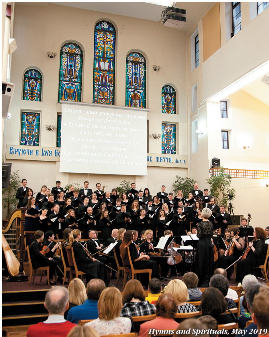
Hymns and Spirituals, May 2019