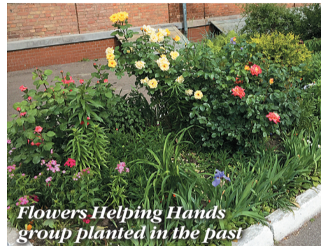
Flowers Helping Hands group planted in the past