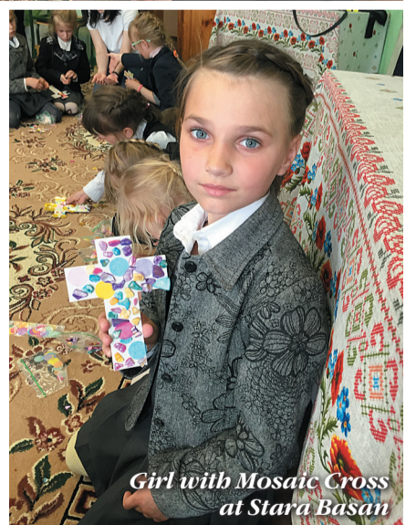
Girl with Mosaic Cross at Stara Basan

Each person who is part of the program is given a ticket when they check in for the service. The MMK team does a great job of registering them each week, but also noticing who is not showing up. This provides the team the opportunity to follow up and check in on the person who missed the study.