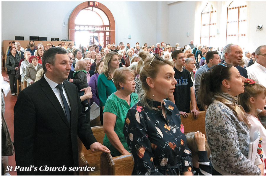
St Paul's Church service

Recently, the group of Americans attending the Helping Hands Mission trip, finished the devotional time with the staff and were encouraged to ask about anything they would like to know about Music Mission Kiev's (MMK) operations there in Kyiv. The dialogue was open and encouraging for everyone. It was amazing to hear how God is working in so many facets of the ministries we serve in Ukraine. MMK has a great team in place in our Kyiv office.