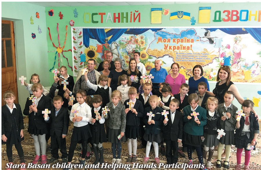
Stara Basan children and Helping Hands Participants