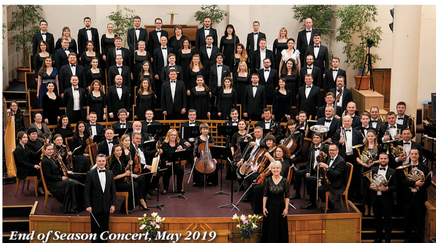
End of Season Concert, May 2019

"The LORD is my strength and my defense; he has become my salvation. He is my God, and I will praise him, my father's God, and I will exalt him". Exodus 15:2