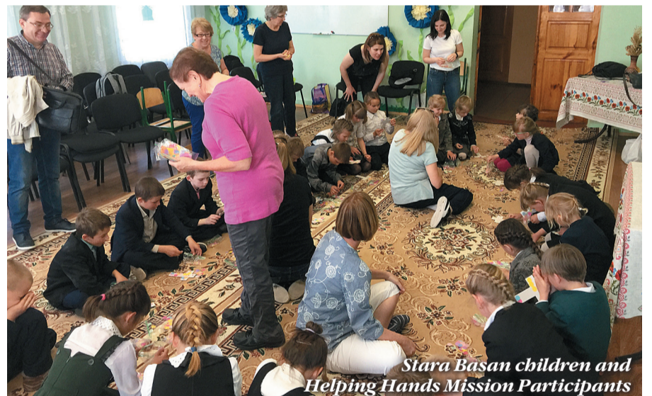
Stara Basan children and Helping Hands Mission Participants